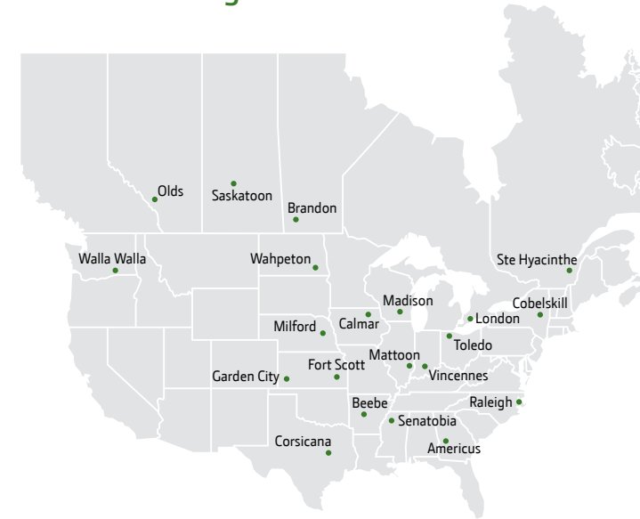
The John Deere TECH program is available at 21 locations.

The John Deere TECH program is an educational experience that will help you put your career in gear, and keep it moving.